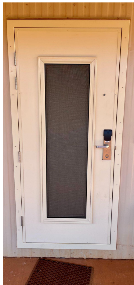
(above) Secure Door in Door installed in pressed steel split frame with RFID mortise lockset.